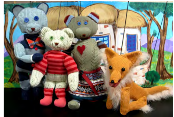
Winners -Swans from Carnival of Animals , and Puppylocks and the Three Bears

The UNIMA USA website describes the award as follows: