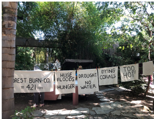
Above: Painted Laundry banners hung out to dry.

All the while between them, five pieces of “dirty laundry” (banners )issues caused by the burning of fossil fuels, were hung on the clothesline by an Extractor character from Extinction Rebellion. Then along came the clean laundry lady who ripped down the “ dirty laundry” and put up five “clean green laundry solutions” (banners) in their place. And in the end as most fairytales go, “they lived happily ever after”. It was impactful and fun for all ages, ending with a positive message.