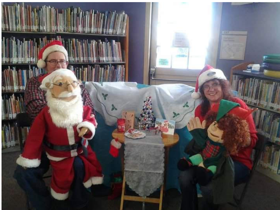
Kennedy Puppets send holiday greetings!