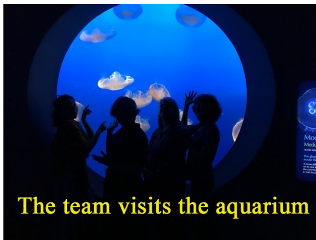
The team visits the aquarium