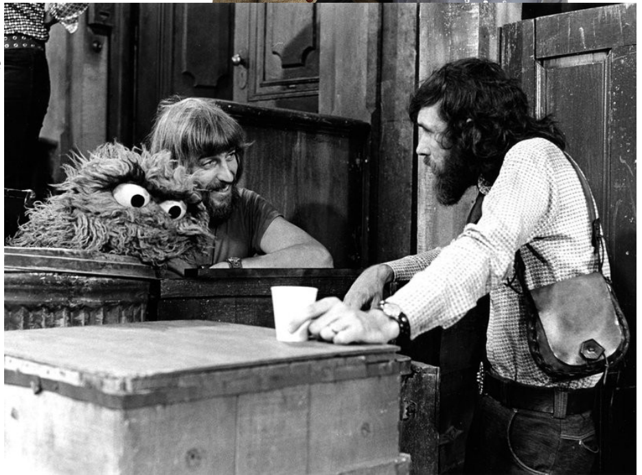
Photo: Carroll Spinney and Jim Henson

Two younger men have been groomed for years to take over Big Bird and Carroll's other puppet, Oscar the Grouch. Carroll has done only the voice of Big Bird for many years. Today's final performance was recorded but is not planned to air on HBO until sometime next year, during Sesame Street's 50th Season.