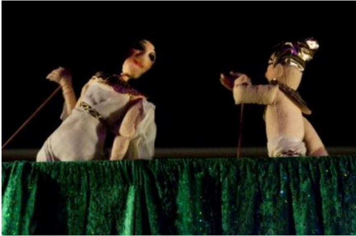
Walk like an Egyptian

*"WALK LIKE AN EGYPTIAN" featured 2 white robed Egyptian dancing rod puppets-complete with their hands