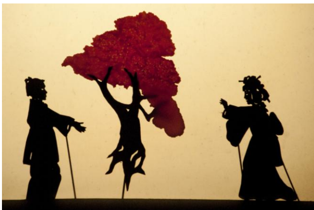
The Pink Persimmon Tree

maker, always suggested having puppets of animals or small children in a scene which needed enlivening, like when changing scenery bits or location. This draws the audience's attention away from stage business.