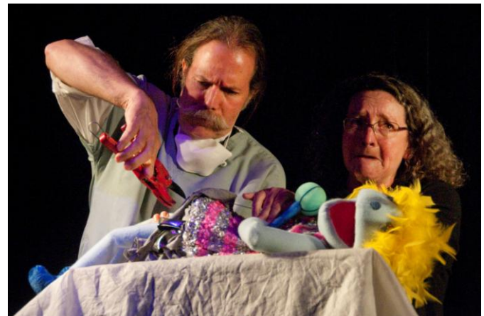
"Take my legs, I'll never use them."