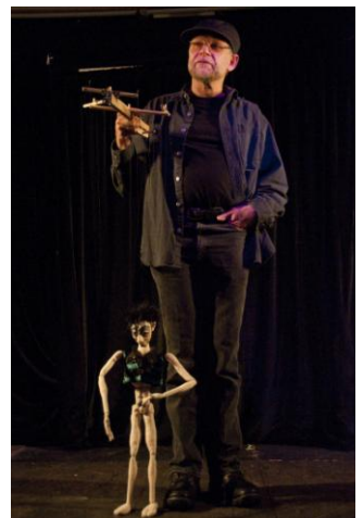
Tree's modern dancer