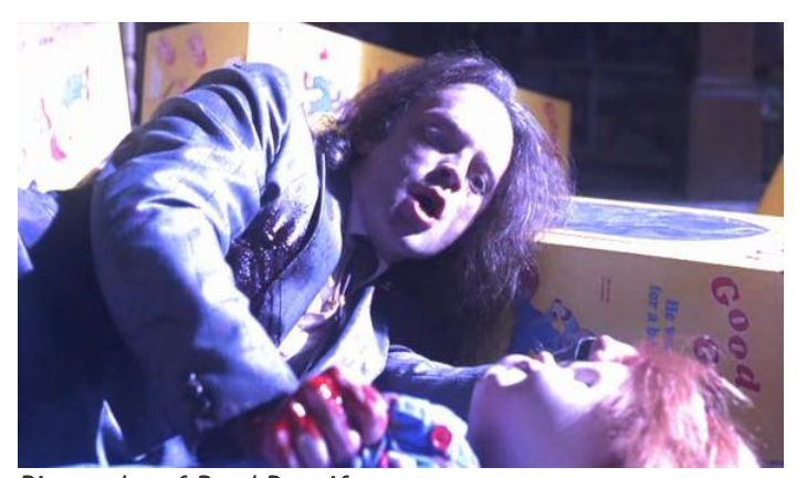
Biography of Brad Dourif