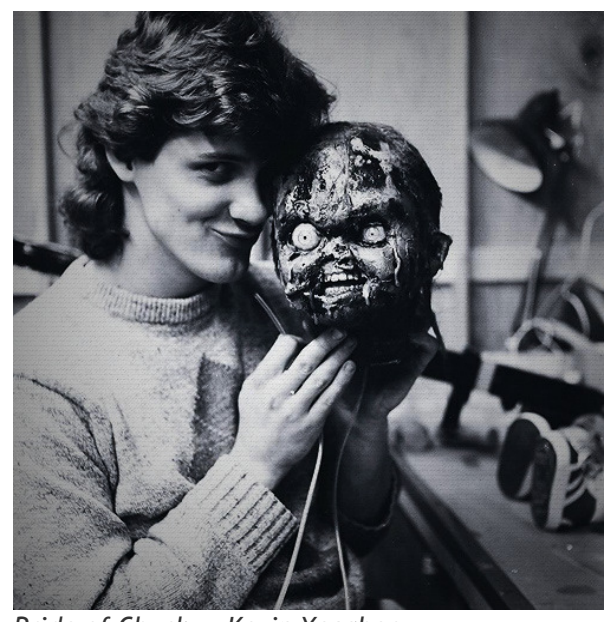
Pride of Chucky - Kevin Yeagher