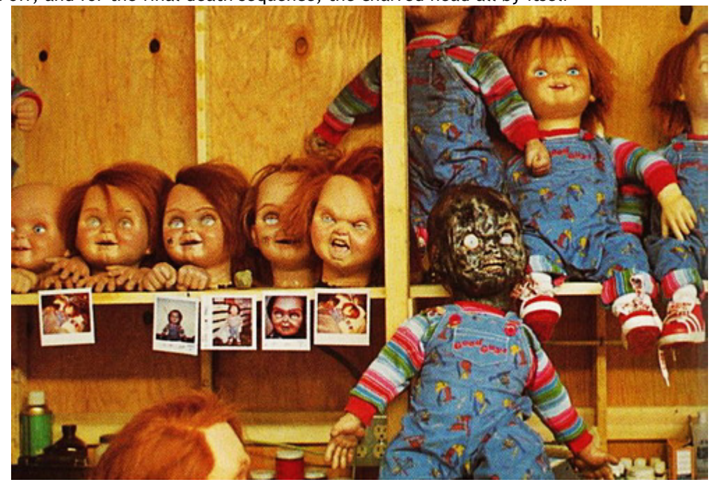
Pride of Chucky - Proboards

The puppets were built at Kevin Yeagher's shop in Burbank, CA. There were many versions of the puppet built for different purposes .One full body servo motor powered puppet was used for walking and wider shots. Servo motors are the motors used by hobbyists for model airplanes. There was one puppet with cable-controlled arms and legs for shots that called for faster movement. Additionally, there were: a stripped-down stunt version, a shaking version powered by a cordless drill motor for the shots where Chucky is set on fire, a charred version that had its arm, leg, and head blown off, and for the final death sequence, the charred head all by itself