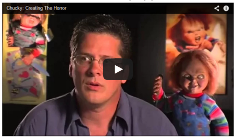
<u>https://www.youtube.com/watch?v=Gowd3VfhmmE</u> (copy and paste into your browser address bar)

Here is a terrific video of the puppet behind the scenes.