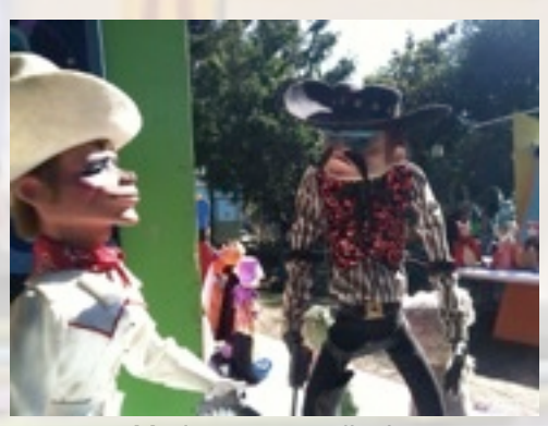
Marionettes on display