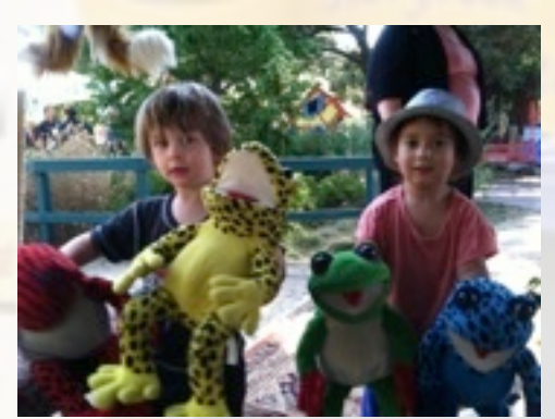
From the puppet tent