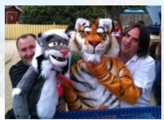
Furville Studios Furry Creatures