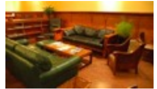
Zocalo's "living room"

Date: June 5th Time: From 6:30 to 9:30ish Place: Zocalo Coffee House 645 Bancroft Ave San Leandro, CA 94577 http://www.zocalo.com/