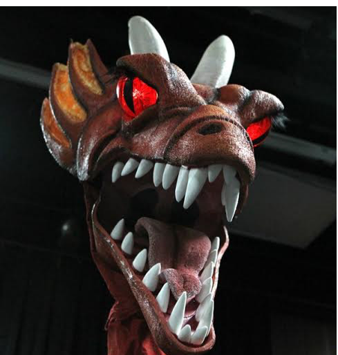
Close up of main head Tiamat the Great!

School for their production of "She Kills Monsters," opening Nov. 13<sup>th</sup>.