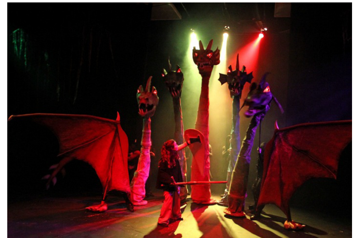
The heroine faces Tiamat in Battle! (photos from article on previous page)

Here are the other dates in case you can not make the two dates above, but would still like to go. Performances: Thursdays, Oct. 9, 30, and Nov 6 at 7:30 pm, Fridays, Oct. 10, 17, 24, 31 and Nov. 7 at 8:00 pm, Saturdays, Oct. 11, 18, 25, Nov. 1, and 8 at 8:00 pm, Matinees! Sundays, Oct. 12, 19, 26, Nov. 2 and 9 at 2:00 pm Novato Theater Company is located at 5420C Nave Drive, Novato, Ca