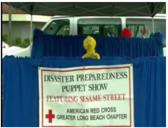
Puppets teach earthquake preparedness in Long Beach.

At 3:20 a.m., August 24, 2014, a 6.0 or 6.2 (depending on source) magnitude earthquake, epicenter near American Canyon and the Napa-Sonoma-Vallejo area, followed a MERE 7 hours and 20 minutes after the closure of the participation of our Guild in Fairyland's Annual Puppet Fair and SFBAPG meeting.