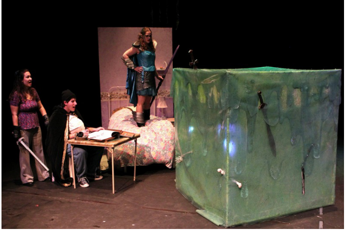
The Glatinous Cube gets ready to absorb a magician!