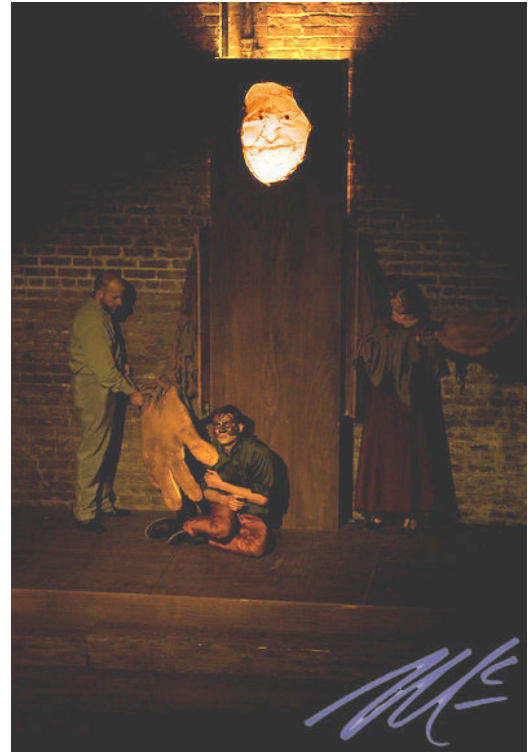
The Giantess could be invisible when not featured.

operated costume-type puppet (when the evil queen had a 10-second change to turn into a hideous, monster). There were 3 magical fish that were rod-puppets. And my personal favorite was the Giantess! The Giantess framed the story, was in the title of the play and had great significance to the world of the play. But she was only supposed to be on stage for a total of 10 minutes (mostly at the beginning and then very briefly at the end). Because of space limitations at the Exit, I had to design the puppet so she could stay on stage for the entire play, but become invisible when she was not featured in the scene. At first, the set designer groaned when I pointed this out, but we had a lot of fun working together. The text also specified that the Giantess' face was mistaken for a moon, so I designed her face to light up like a moon when lit from behind. During the rest of the play, when she was supposed to be invisible, she blended into the false support beam that we created. I covered her wire-frame face with a fabric that matched the rest of the wood beautifully, so it just looked like a knot in the wood. I also created hinged doors that opened to let her arms and hands come out. Two actors controlled these rods, and when they were finished, the arms tucked away back into the beam to disappear. This was a really fun project, and my puppets are going into storage now in hopes that the play will have another showing in another city someday soon!