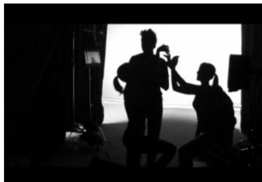
Hand shadows from shadow commercial.